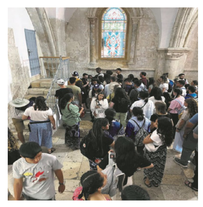
The upper room.